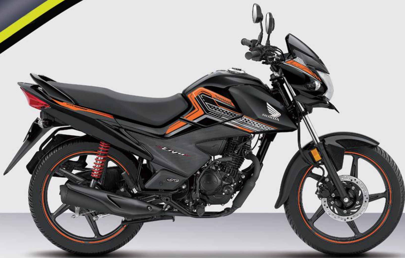
PEARL IGNEOUS BLACK (Pearl Igneous Black Shroud + Orange Stripes)