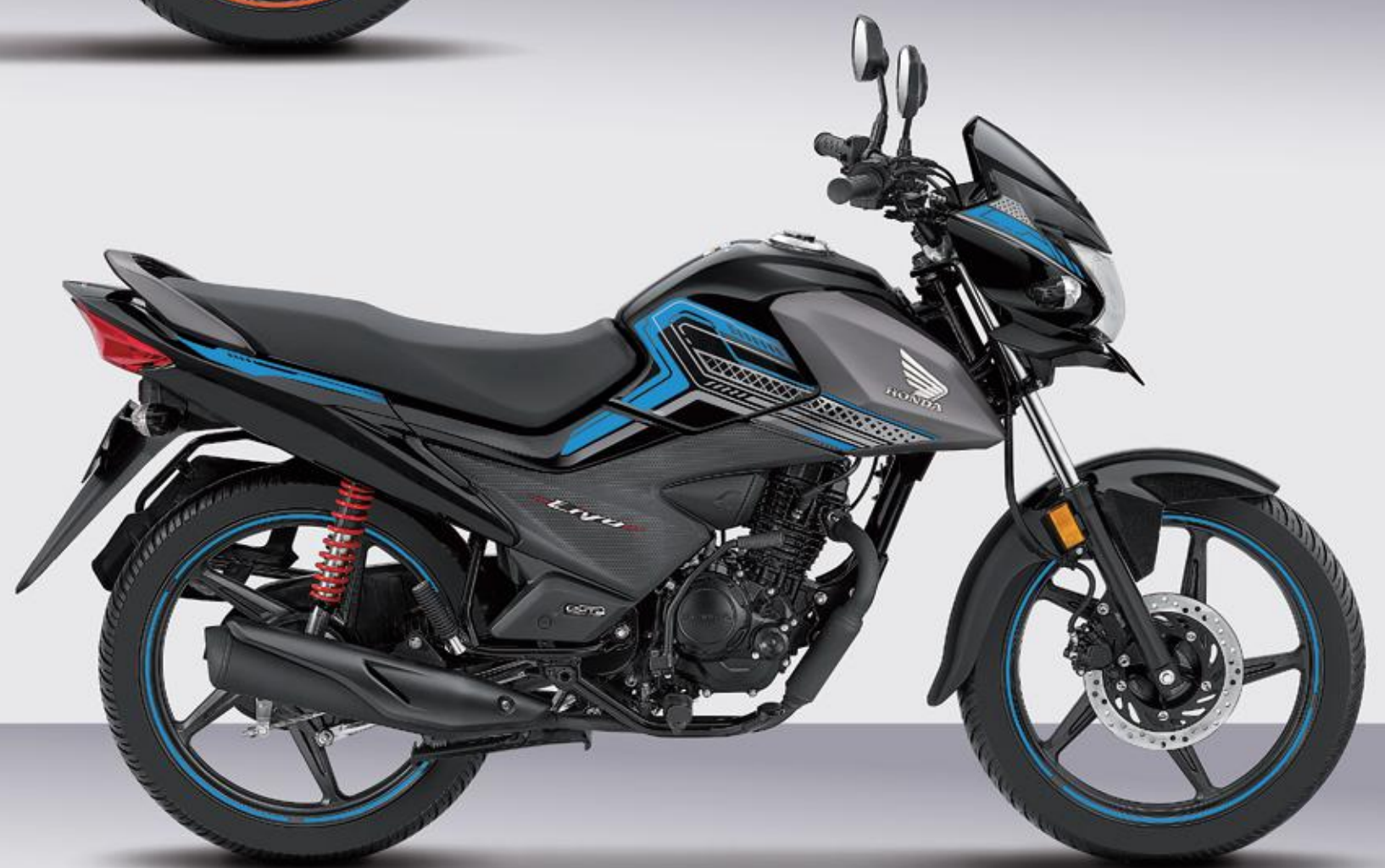
PEARL IGNEOUS BLACK (Geny Gray Shroud + Blue Stripes)