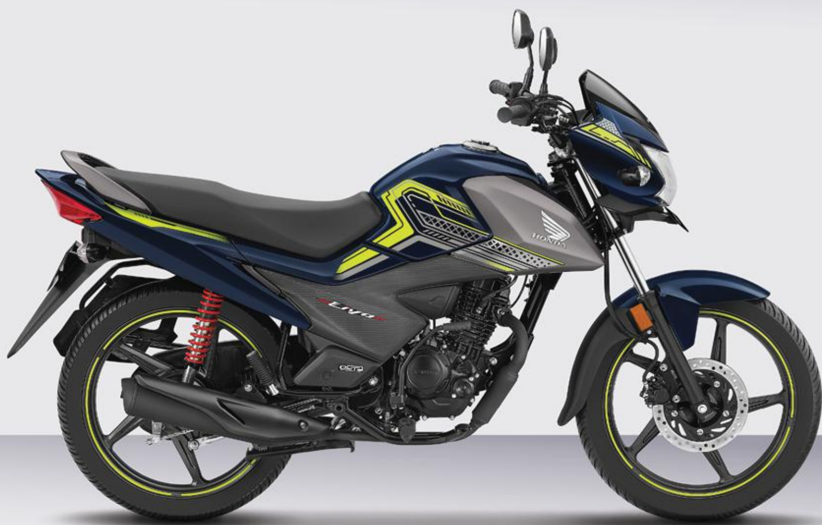
PEARL SIREN BLUE A (Geny Gray Shroud + Green Stripes)