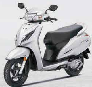
Pearl Precious White