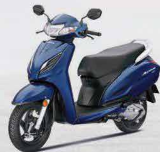
Decent Blue Metallic