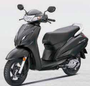
Mat Axis Grey Metallic

•+The technical specifications and design of the vehicle may vary according to the requirements and conditions without any notice • Activa meets Bharat Stage VI norms • Product shown in the picture may vary from actual product available in the market • Accessories shown in the picture are not part of standard equipment • The technical specifications mentioned are for Smart Key variant • All features may not be part of all variants • **Conditions apply